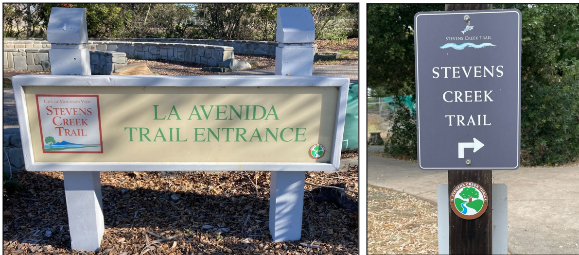
Medallion Installed at La Avenida Trail Entrance & Near Cupertino's Stockmeir House

Space Preserve and Stevens Creek County Park in 2022. The medallion was developed in collaboration with a working group of public agencies in the region (Cities of Mountain View, Sunnyvale, Cupertino, and Los Altos, Santa Clara County Parks and Midpeninsula Open Space District) and other regional trail partners (Bay Area Ridge Trail and San Francisco Bay Trail). Sunnyvale will include the medallions in their trail as it is implemented in the coming years. Midpen and SCCP plan projects in 2024 to develop segments in the upper Stevens Creek watershed that will also include SCT medallions.