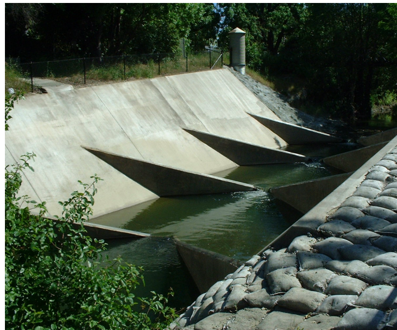
The Friends' study looked at six specific fish passage barriers to come up with improvements like this one at Central Avenue.