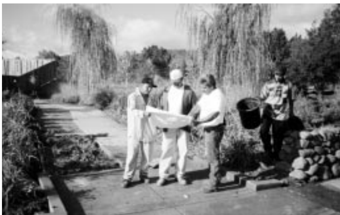
The O'Brien Development Team reviewing plans for the Stevens Creek Trail at the gateway to the neighborhood.

On another note, the O'Brien Group Development Company as part of a new residential development has constructed approximately 200 yards of trail section. This neighborhood adjoins the proposed alignment for the Stevens Creek Trail near Rancho San Antonio County Park along Cristo Rey Drive. The trail section constructed by the O'Brien Group includes two ponds and a resting area for trail users as part of the gateway into the new neighborhood. The Friends, City of Cupertino and Santa Clara County Parks and Recreation Department worked with the Developer on the implementation. This clearly demonstrates that developers see that neighborhoods can greatly benefit from trails.