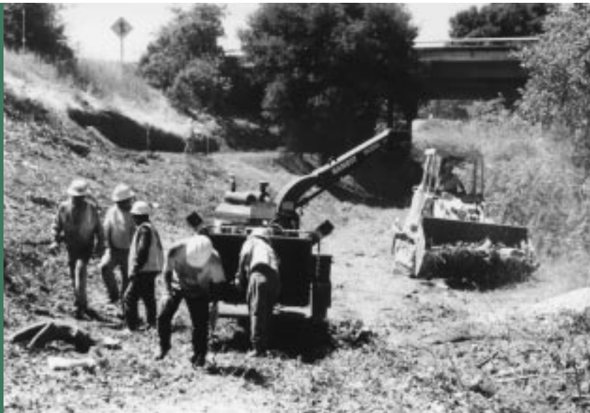
The start of trail construction on Reach 4, Segment 1