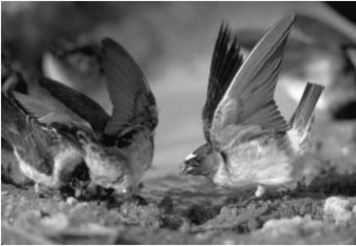
Above: Cliff Swallows dining on insects Right: Artistic rendition of the mud nests made by these curious birds