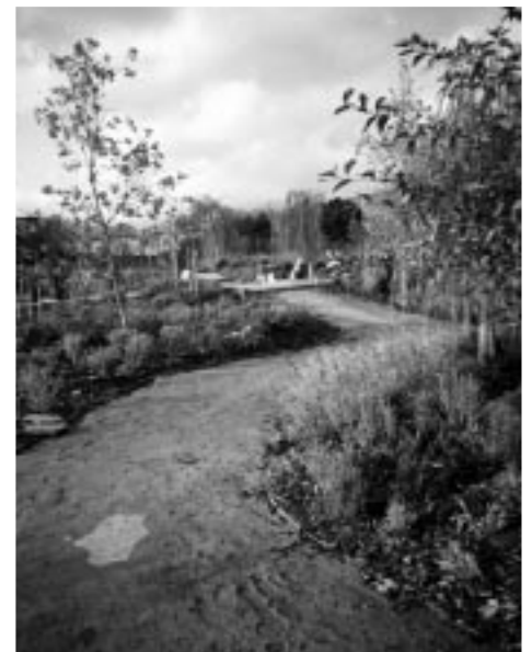
Coming from Rancho San Antonio County Park towards the new neighborhood.

Field trips have been conducted for each of the study areas in which the Task Force reviewed environmental, safety, privacy and technical challenges along potential alignments. The Consultants for the feasibility study have provided much information on the opportunities and impacts along these alignments. Later this fall, the Task Force will select a trail route from a variety of alignment alternatives with final recommendations to be forwarded to the Cupertino Parks and Recreation Commission—and ultimately, City Council. Supporters are strongly encouraged to attend these sessions. For more information please check the Task Force web site at www.rahul.net/green/sct .