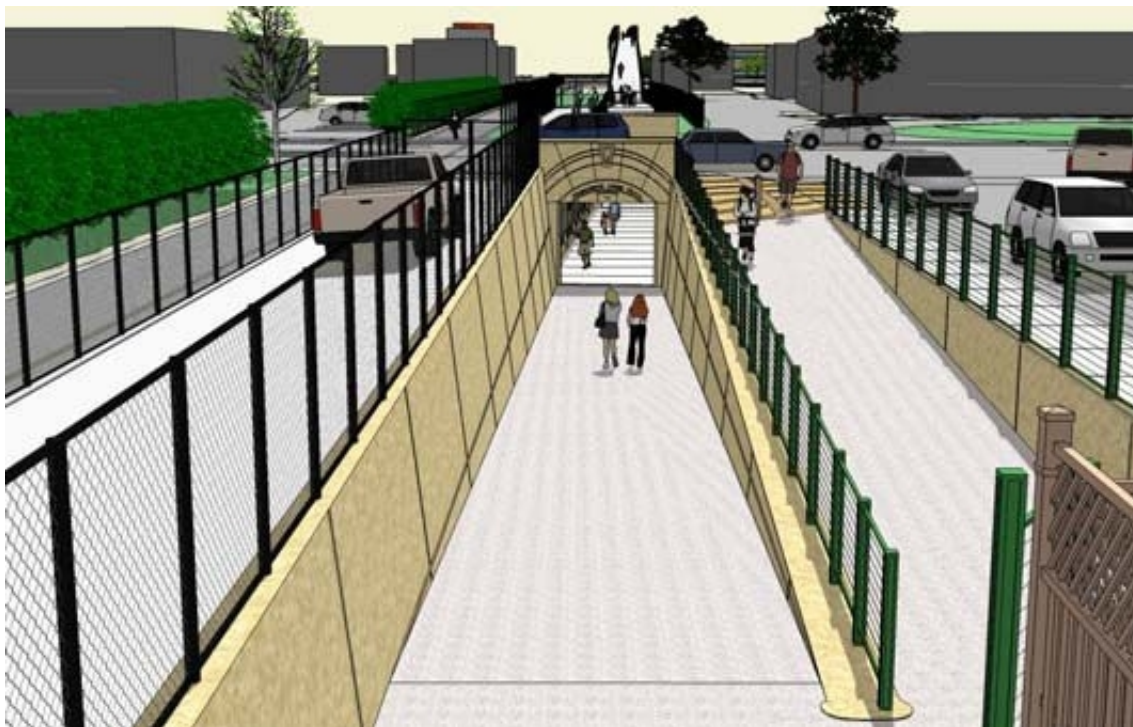
A tunnel for the Permanente Creek Trail set for construction under Old Middlefield Way near Highway 101.