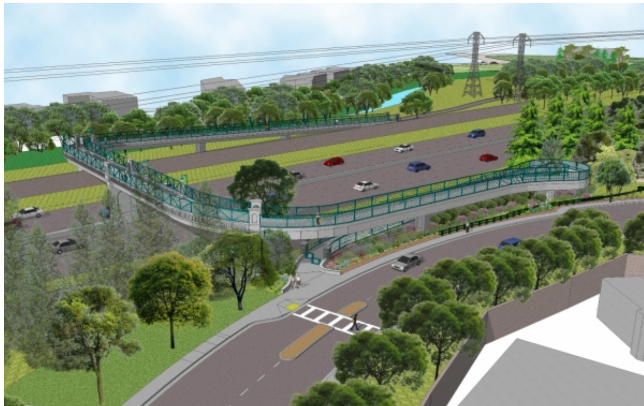
The Stevens Creek Trail bridge over Highway 85 to Dale Avenue. It is expected to break ground in February.