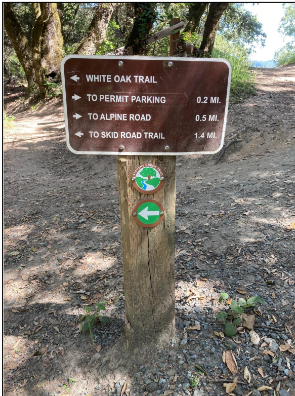
Monte Bello White Oak Trail