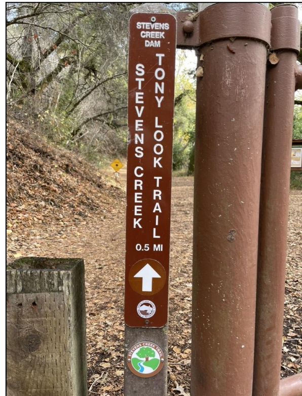
Stevens Creek/Tony Look Trail